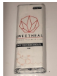
Cannabinoids (% weight)